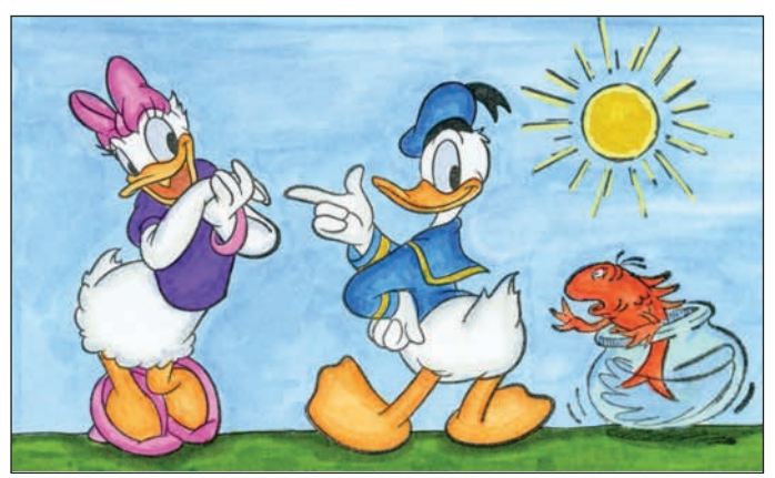
What's Donald without Daisy?