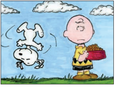
Snoopy is head-over-heels after seeing your ad in RSM.

RSM encourages stampers and stamping. We provide information about conventions, retreats, and events. Numerous pieces of stamp art in each issue include stamp and product credits. Ask your design team and/or friends to send in stamp art to showcase your stamps and products.