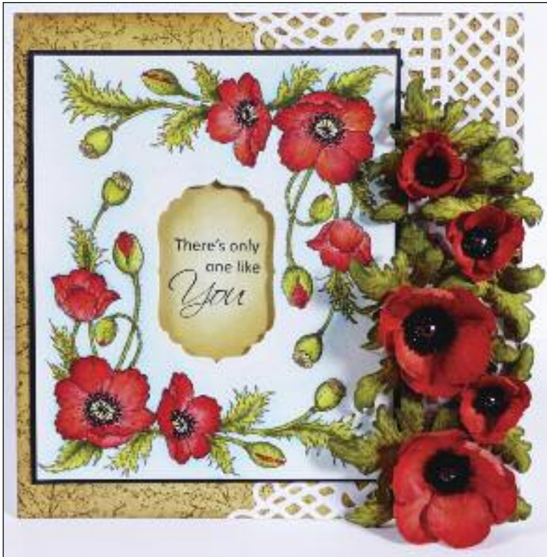
ONE LIKE YOU / Nupur Priya for Heartfelt Creations (Stamp credits: Blazing Poppy Petals, Poppy Corner and Border, Blazing Poppy Fillers, Delightful Daisies, Classic Message — Heartfelt Creations.)

stamped with Imagine Crafts/Tsukineko Memento Tuxedo Black ink, colored with Staedtler Karat Aquarelle colored pencils and blended with a water brush for a softer look.