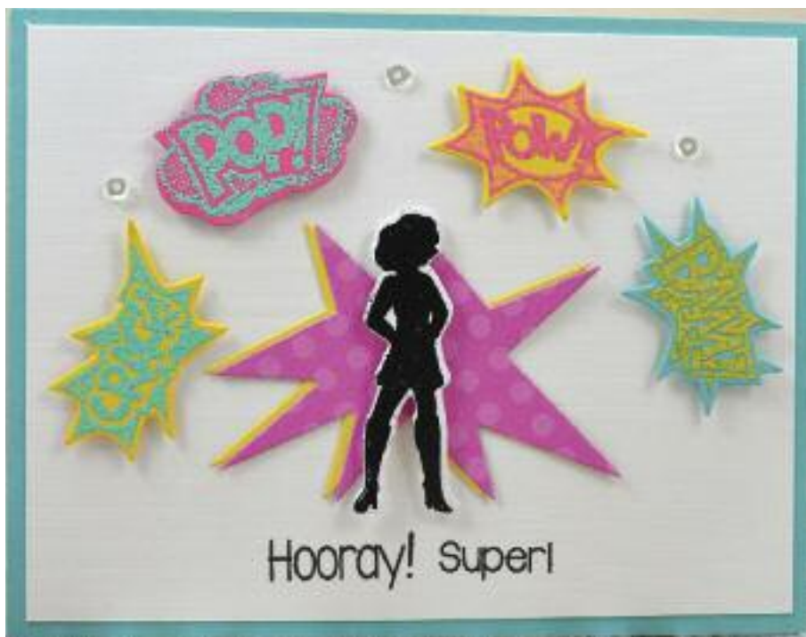
HOORAY! SUPER! / Jen Carter for Frantic Stamper

Frantic Stamper is an online paper crafting store that carries a