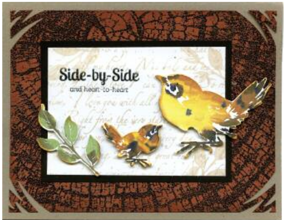
SIDE-BY-SIDE / Lisa Yang for Local King Rubber Stamp (Stamp credits: Chicks, Timberline background, Words background — Local King Rubber Stamps.)

5. Stamp the sentiment on white cardstock; ink the edges and adhere the sentiment behind the