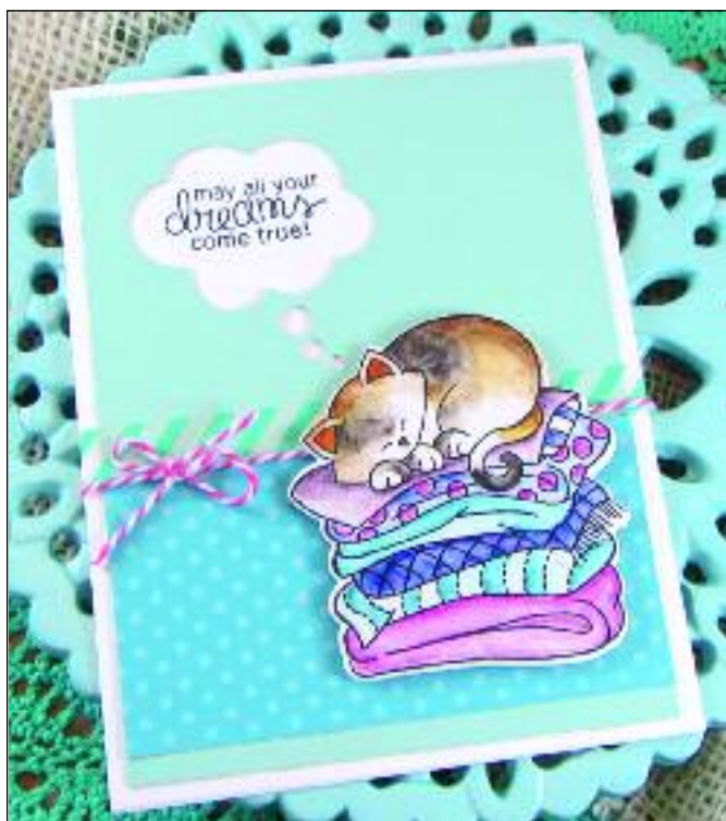
DREAMS COME TRUE / Jennifer Jackson for Newton’s Nook Designs (Stamp credits: Newton’s Naptime — Newton’s Nook Designs .)

“I often just look at the images I’m creating with and try to design a card that conveys the way the images make me feel,” shares Jackson.